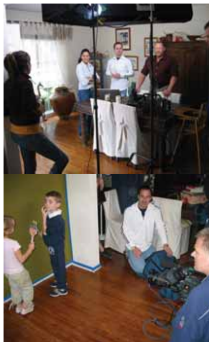
ON THE SET Behind the scenes with the cast and crew of Sell This House

Each week, a different home in a new locale is featured. The unifying factor is that all the houses chosen have been on the market for some time with nary a nibble. An open house is set up and prospective buyers